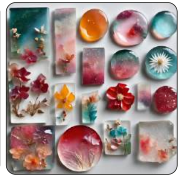
Art & Crafts