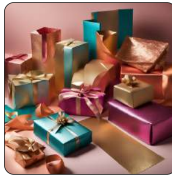
Paper & Packing