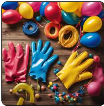
Rubber & Latex