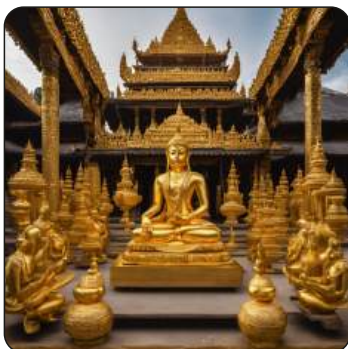
Idol / Sculpture